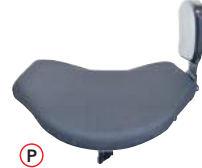
P Swing-Away Arm with X-Large Pad NMAPS-DLTSS