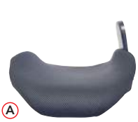
A Short Fixed Arm with Small Pad NLAFS-NLPHS