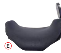
E Extendable Swing-Away Arm with Large Pads NLASA-NLPSL