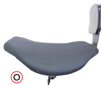
O Fixed Arm with X-Large Pad NMAPS-DLTSF