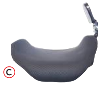
C Short Swing-Away Arm with Small Pad NLASS-NLPSS