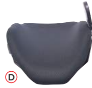
D Short Swing-Away Arm with Large Pad NLASS-NLPSL