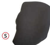
S Double Contour NIB-0573