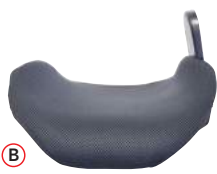
B Short Fixed Arm with Large Pad NLAFS-NLPHL