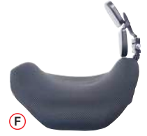
F Extendable Swing-Away Arm with Dual Small Pads NLASA-NLPTSS