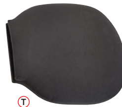
T Armadillo Large NIB-1413